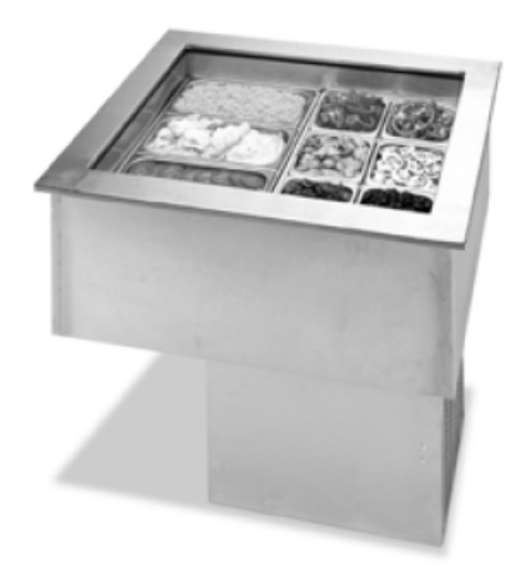
Model: Drop-In Cold Well