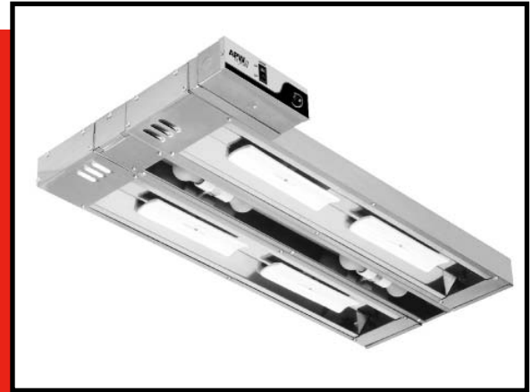
C*RADIANT™ DOUBLE OVERHEAD WARMERS