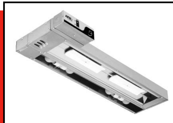
C*RADIANT™ LIGHTED SINGLE OVERHEAD