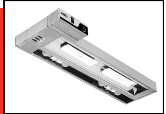
C*RADIANT™ LIGHTED SINGLE OVERHEAD