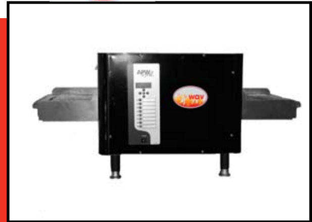
Flexwav THROUGH CONVEYOR TOASTER