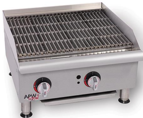
Model GCB-24i Gas Radiant CharBroiler