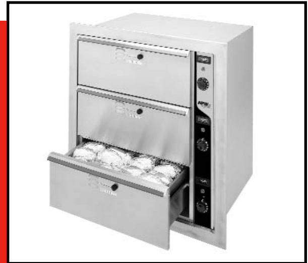
Built-In Holding Drawer