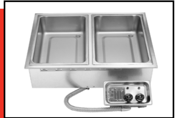
Top Mount w/EZ-Lock