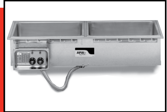
Top Mount Hot Food Well

Heavy-duty Top mount insulated Rectangular Drop-In Food The Slim line Top Mount Food well is designed for installation in metal or wood countertop. The well is designed to accommodate standard size steam table pans. The well is constructed of deep drawn 20 ga. Type 304 stainless steel above countertop with 20 ga. aluminized outer housing with sides bottom fully insulated. Units shipped with drain are provided with stainless steel 1/2" NPT drain welded to bottom of pan provided with removable screen. The well is heated by tubular heating element shaped in serpentine fashion for even heat distribution to pan base. The element is mounted under well and secured by aluminized deflector, shield for maximum efficiency. The unit is standard with APW Wyott EZ Locks on all four exterior sides for easy installation. The units feature complete UL construction including electrical conduit, bezel and control box.