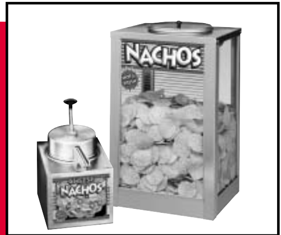
Nacho Cheese Pump with Nacho Cabinet