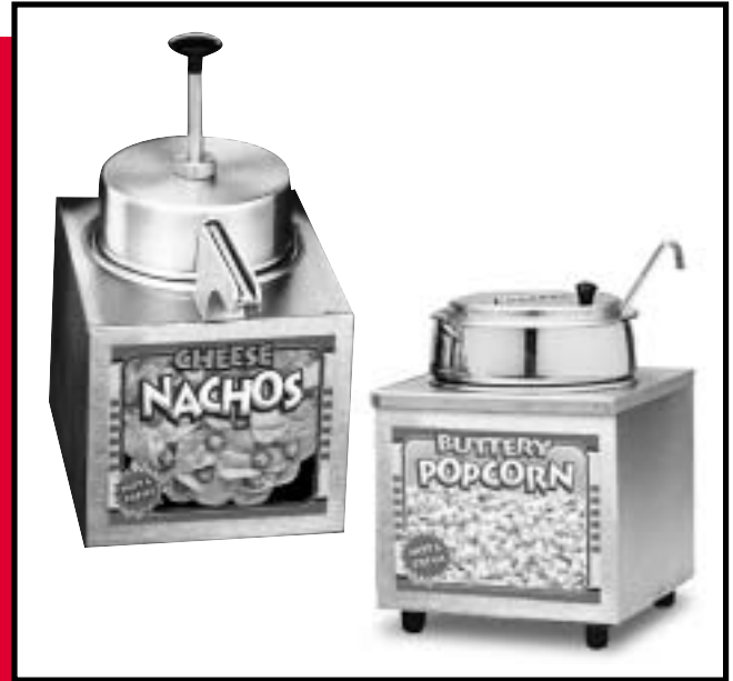
Nacho Cheese Pump and Hot Butter Warmer