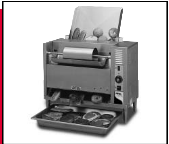
MODEL M-83 BUN GRILL TOASTER