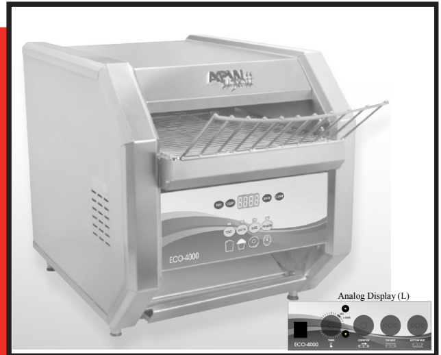
ECO 4000 QST 500 E