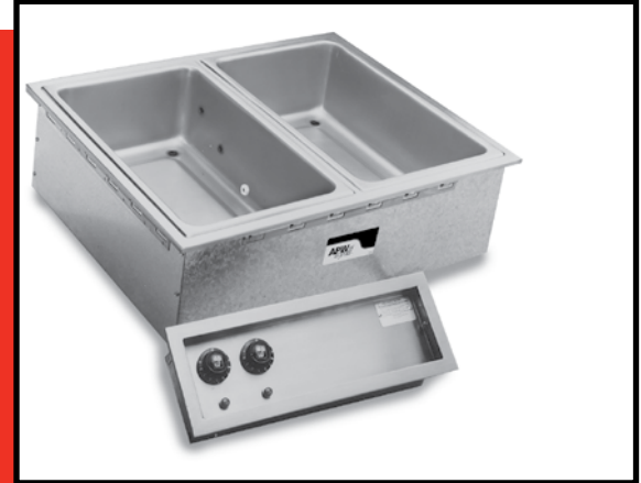
Insulated EZ-Fill Hot Food Well (SHFWEZ-2)