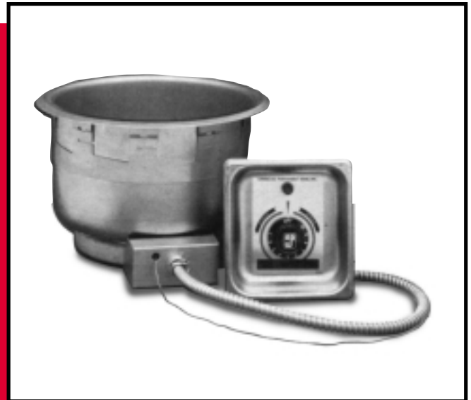
MODEL SM-50-11D UL HOT FOOD WELL