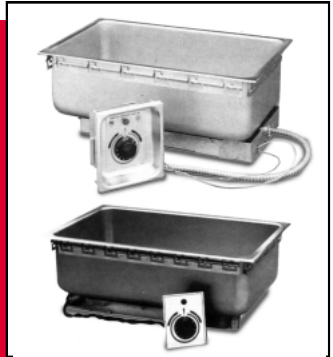
Top Mount Hot Food Well