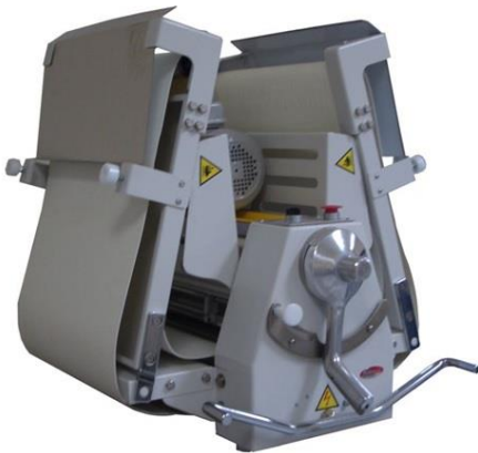
Easily folds to save space when not in use

The BakeMax BMCRS Series Countertop Reversible Sheeters are perfect for Bakeries, Pastry Shops, Hotels, Restaurants and more. They are suitable for sheeting and stretching Puff Pastry, Danish Bread, Fondant, Donut Dough, Croissants, Pie Crusts, Cookie Dough, Strudel, Marzipan, and Pizza Dough.