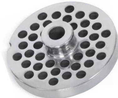
2 Plates Included (6mm & 8mm) Additional Accessories Available Upon Request

** Due to continuous product improvement, specifications are subject to change without notice.