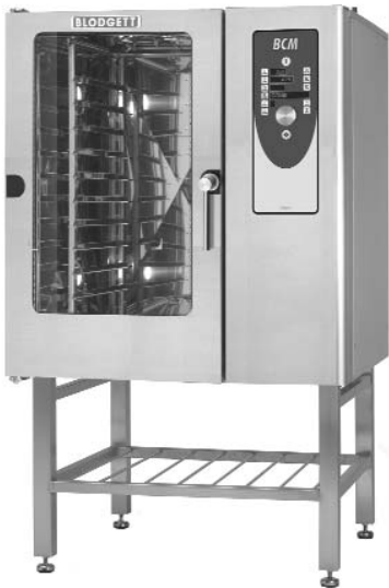
Shown on optional stand with shelf and adjustable feet