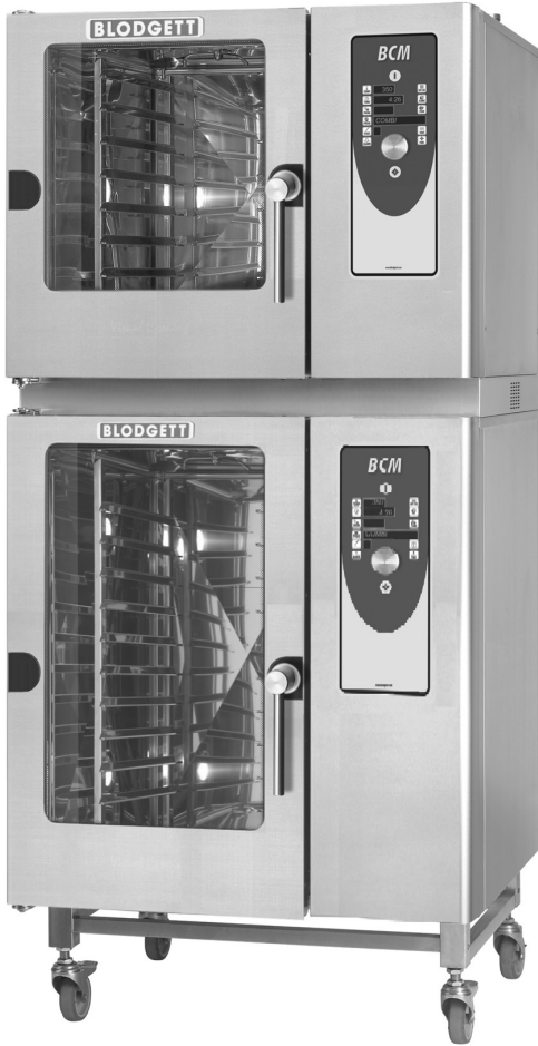
Shown with optional casters