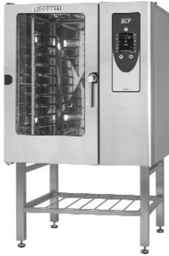
Shown on optional stand with shelf and adjustable feet

Single Electric Combination-Oven/Steamer