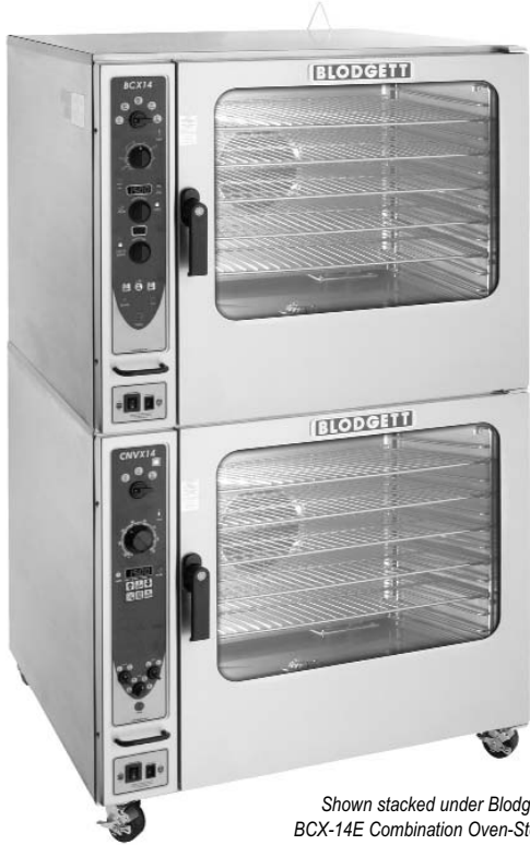
Shown stacked under Blodgett BCX-14E Combination Oven-Steamer