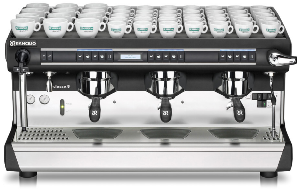
Shown with Optional iSteam