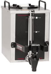
1.5GPR-FF, TOP HNDL