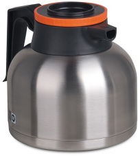
CARAFE, SST 1.9L SHRT ORN 1/