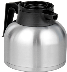
CARAFE, SST 1.9L SHRT BLK 12/