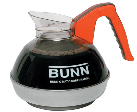
EASY POUR,(ORN) 6/CS