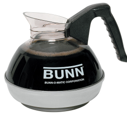
EASY POUR,(BLK) 12/CS