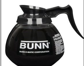
DECANTER,GLASS-BLK 12CUP 1PK