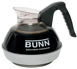
EASY POUR,(BLK) 1/CS