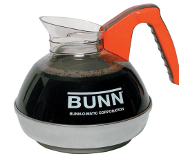
EASY POUR,(ORN) 3/CS