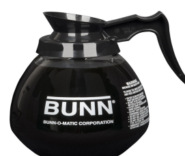
DECANTER,GLASS-BLK 12C 24/CS