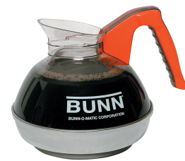
EASY POUR,(ORN) 12/CS