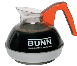
EASY POUR,(ORN) 2/CS