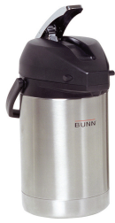
AIRPOT, 2.5L SST LA 6/ CASE