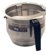
FUNNEL AY,W/DECAL GRT "C"7.62