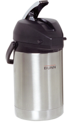
AIRPOT, 2.5L SST LA SINGLE PK