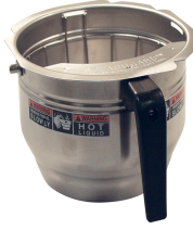
FUNNEL AY,W/DECAL GRT "C"7.12