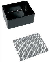
DRIP TRAY KIT (2.5"HT-HW2)