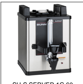
SH-S SERVER 1G 60 MIN ADJ TMR