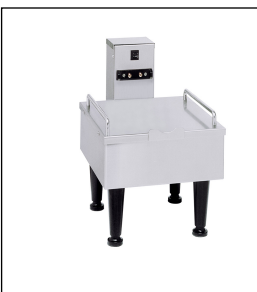
1SH STAND, 120V