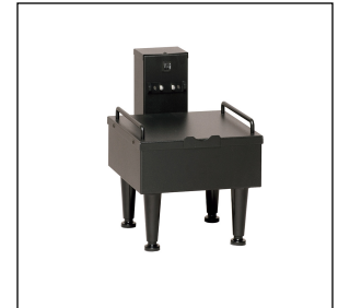
1SH STAND,120V BLK