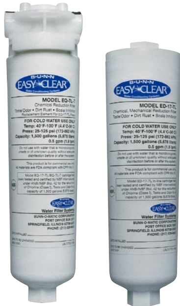
Model EQ-17-TL or ED-17-TL Water Quality System