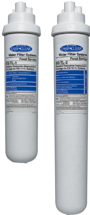
Model EQ-11-TL & EQ-12-TL Water Quality Systems