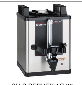
SH-S SERVER 1G 60 MIN ADJ TMR