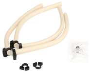
TUBE KIT, .188 PUMP LCC/LCA