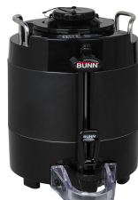
TF SERVER, 1G/3.8L MECH BLK NOBASE