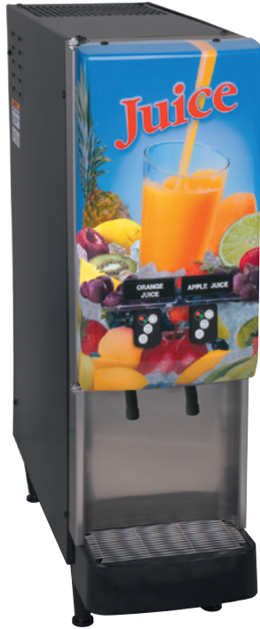
Model JDF-2S w/Lighted Graphics

Dimensions: 33.1"H x 10"W x 25.5"D (84.1 cm H x 24.9 cm W x 64.8 cm D)