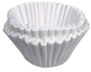
FILTERS,REGULAR1M 500/2 50/CL