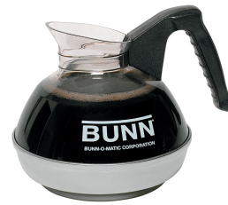
EASY POUR,(BLK) 24/CS