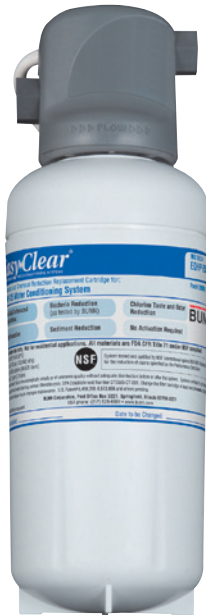
Model EQHP-25L or EQHP-25 Water Quality System