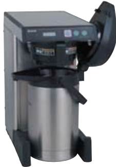
Model WAVE15-APS with Airpot

(airpot sold separately) Dimensions: 16.9" H x 8.7 W x 17.1" D (43cm H x 22.2cm W x 43.5cm D)