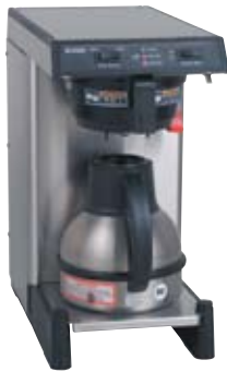
Model WAVE15-S-APS with Deluxe 1.9L Thermal Carafe

(airpot sold separately) Dimensions: 16.9" H x 8.7 W x 17.1" D (43cm H x 22.2cm W x 43.5cm D)