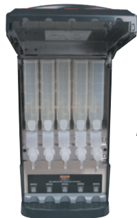
Top hinged door inside view

Dimensions: 32.8" H x 19.3" W x 24" D (83.2cm H x 59.5cm W x 61cm D)