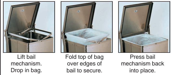
Lift bail mechanism. Drop in bag.

Internal bail mechanism secures disposable bag.