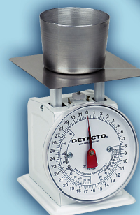
Model PT-2C with measuring cup and dial chart for overrun percentages

Dial Size: 6" / 15 cm diameter Platform Size: 7.875"W x 5.875"D / 20 cm W x 15 cm D stainless steel Overall Size: 5.25"W x 7.25"D x 7.5"H / 13 cm W x 18 cm D x 19 cm H Shipping Weight: 6 lb / 2.3 kg