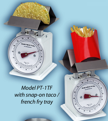
Model PT-1TF with snap-on taco / french fry tray

Dial Size: 6" / 15 cm diameter Platform Size: 7.875"W x 5.875"D / 20 cm W x 15 cm D stainless steel Overall Size: 5.25"W x 7.25"D x 7.5"H / 13 cm W x 18 cm D x 19 cm H Shipping Weight: 6 lb / 2.3 kg