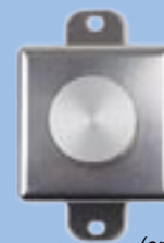
(optional*) Mountable Pushbutton