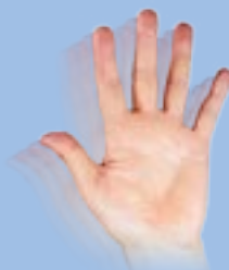
Lite Weigh Hands-Free