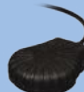
Foot Pedal (optional*)