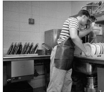
Water Temperature Recovery Table