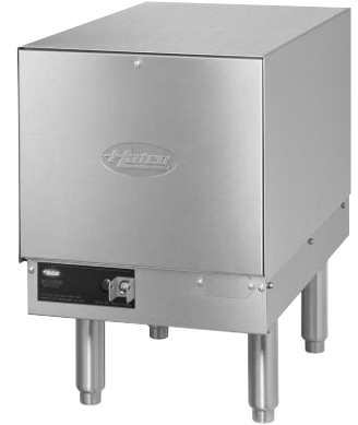
Model C-18 with optional 6" (152 mm) stainless steel adjustable legs