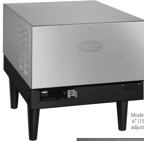
Model C-45 with 6" (152 mm) adjustable legs