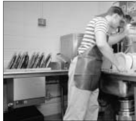
Water Temperature Recovery Table