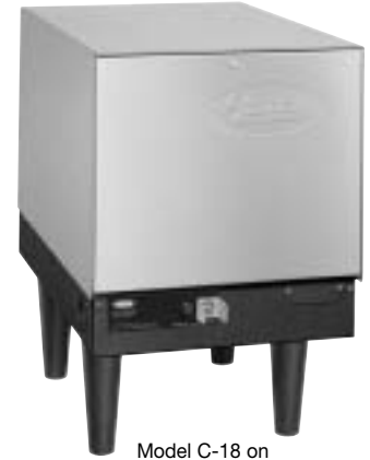
Model C-18 on 6" (152 mm) legs