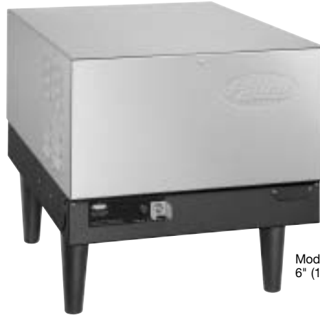
Model C-24 on 6" (152 mm) legs