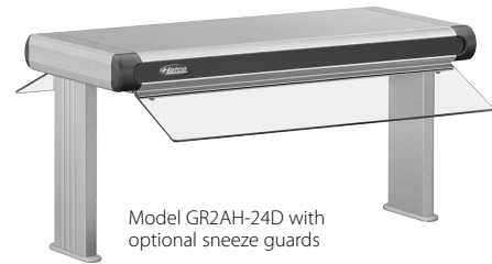
Model GR2AH-24D with optional sneeze guards