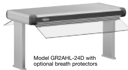
Model GR2AHL-24D with optional breath protectors