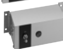
Model RMB-3F with toggle switch and indicator light