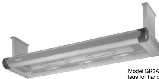
Model GR2AL-36 with Designer legs for hanging installations