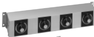
Model RMB-14D with infinite controls