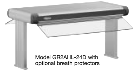
Model GR2AHL-24D with optional breath protectors