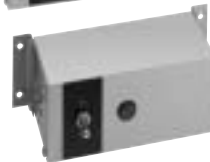
Model RMB-3F with toggle switch and indicator light