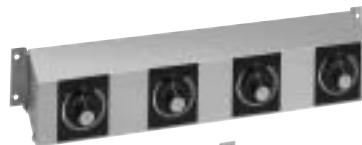
Model RMB-14D with infinite controls