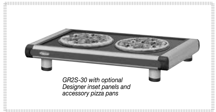
GR2S-30 with optional Designer inset panels and accessory pizza pans