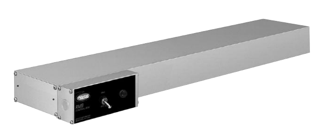
Model GRAM-18 with Control Enclosure with toggle switch and indicator light