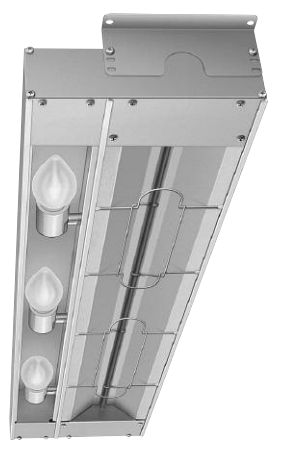
Model GRAML-36 with shatter-resistant incandescent lights, remote control enclosure (not pictured), and standard angle brackets