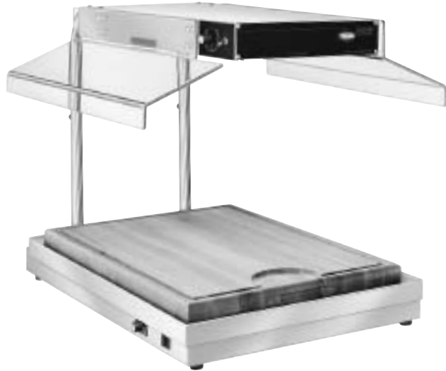
Model GRCSCLH-24 with optional base heat, left-hand breath protector, drip pan, and cutting board

CERAMIC AND BLANKET HEATING ELEMENTS GUARANTEED AGAINST BURNOUT AND BREAKAGE FOR ONE YEAR.