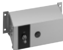
Model RMB-3F with toggle switch and indicator light