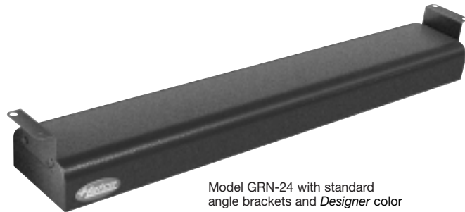
Model GRN-24 with standard angle brackets and Designer color